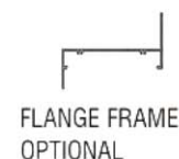
FLANGE FRAME OPTIONAL