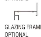
GLAZING FRAME OPTIONAL